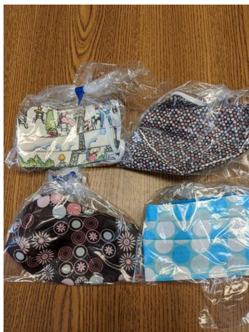
Masks donated to Mercer County seniors