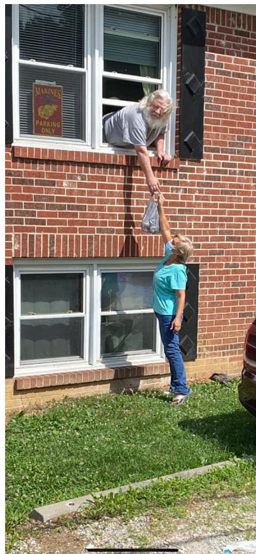
Anderson County Senior Center makes deliveries to seniors