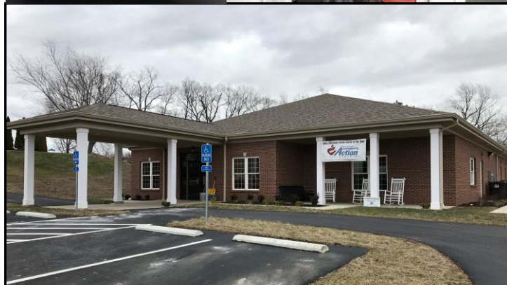
Top- meal served to Bourbon County Senior Bottom- Bourbon County Senior Center