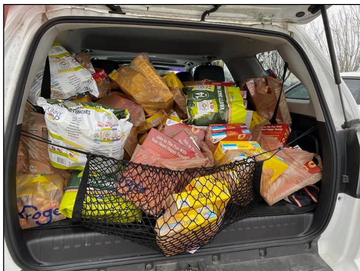
Above: Woodford County Senior Center delivers heart healthy snack bags

Woodford County Senior Center has already been busy since the arrival of the new director. Heart healthy snack bags were prepared and delivered to Woodford county seniors to celebrate Healthy Heart Month.