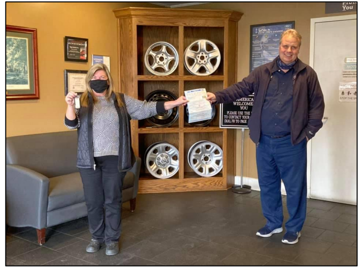
Capital City Activity Center received a donation of a Nissan Maxima for meal delivery from Topy America