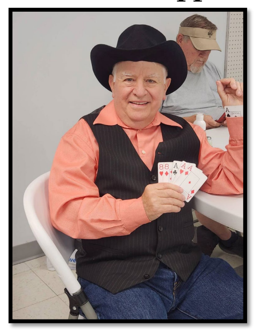
Nicholas County seniors looking sharp for hat day