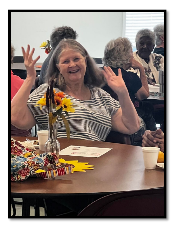
Anderson County seniors enjoyed live music