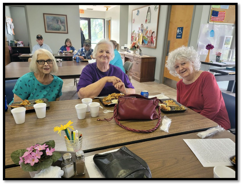
Estill County Seniors enjoyed their annual fish fry along with karaoke and line dancing